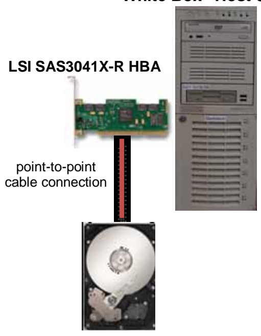
Samsung Spinpoint F1 RAID Class HE103UJ SATA disk drive